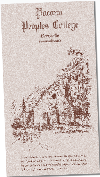
This brochure, in the collection of Monroe County Historical Association, describes in beautiful prose what students could expect at the college.

This kind of education dated to the 1800s in Denmark. The goal was to create ways rural people could educate themselves to live in the modern world without losing their own traditions. Progressive education leaders believed that, after the "gilded age" in the U.S., rural people were being left behind. Perhaps the Danish model could be used here.