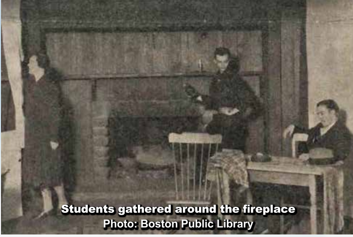
Students gathered around the fireplace

Players, would write, rehearse and perform plays, traveling the area and entertaining at the resorts.